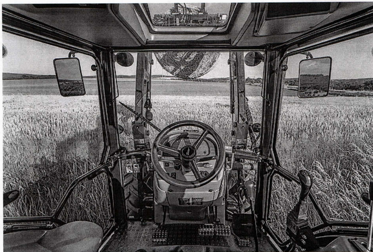
Standard window in roof (Major series shown).